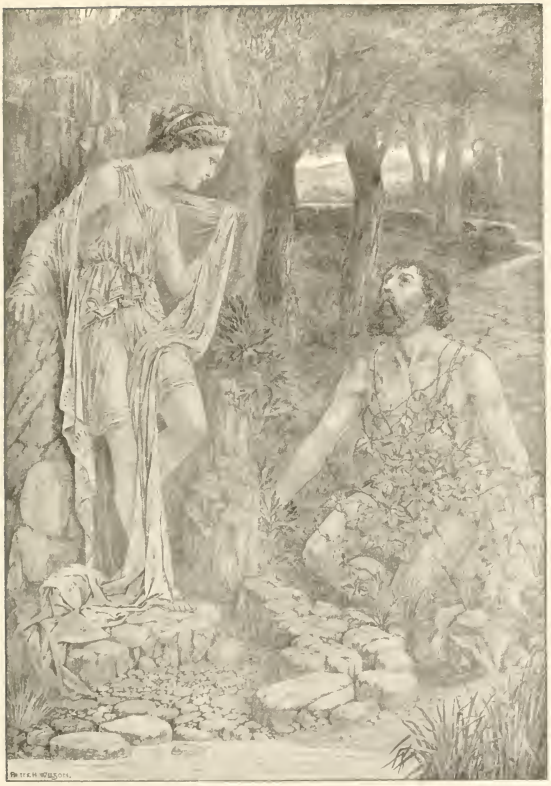
NAUSICAA AND ODYSSEUS