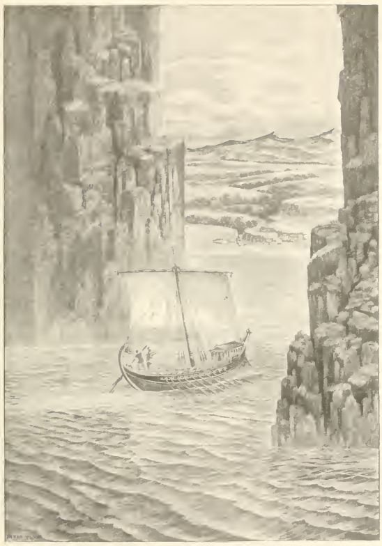
THE ARRIVAL AT ITHACA