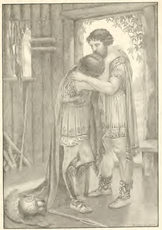
TELEMACHUS RECOGNIZES HIS FATHER