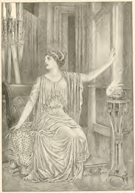
PENELOPEIA UNRAVELS HER WEB