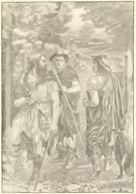
THE MEETING WITH MELANTHIUS