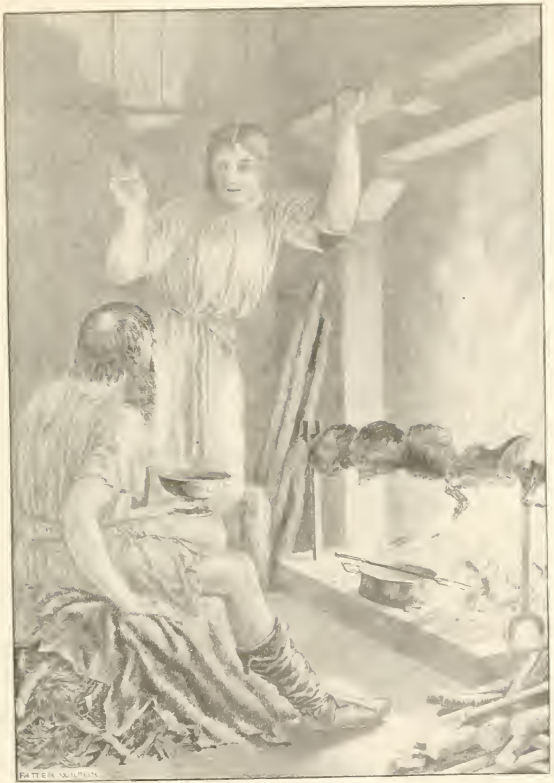
IN THE COTTAGE OF THE SWINEHERD