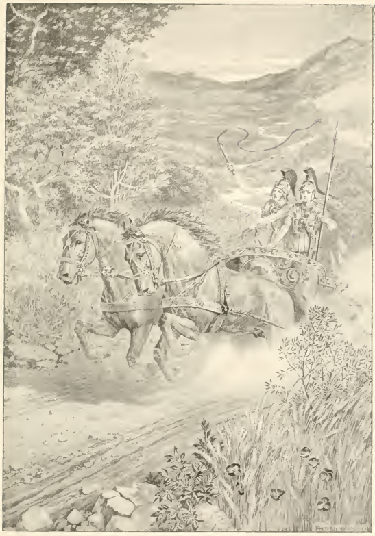
TELEMACHUS AND PEISISTRATUS ARRIVE AT LACEDAEMON