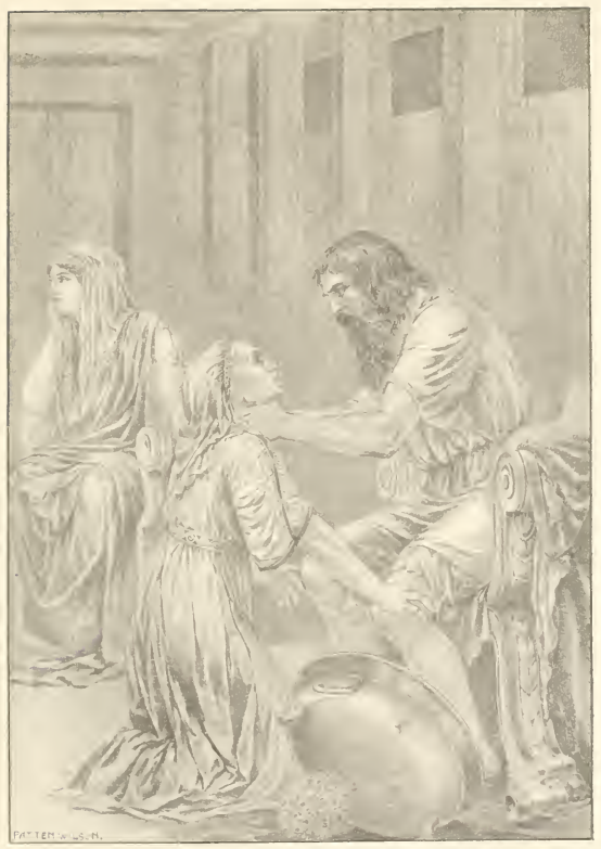
THE RECOGNITION OF ODYSSEUS BY EURYCLEIA