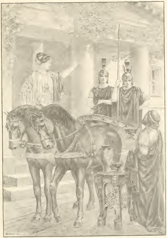
"FAREWELL TO YOU BOTH, YOUNG MEN!"