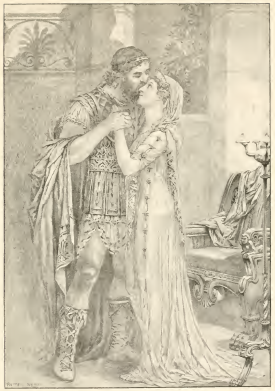
THE RECOGNITION OF ODYSSEUS BY HIS WIFE