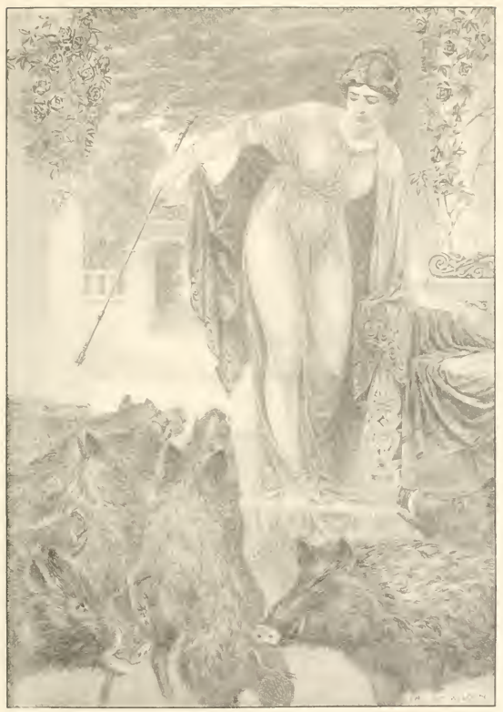
CIRCE AND THE COMRADES OF ODYSSEUS