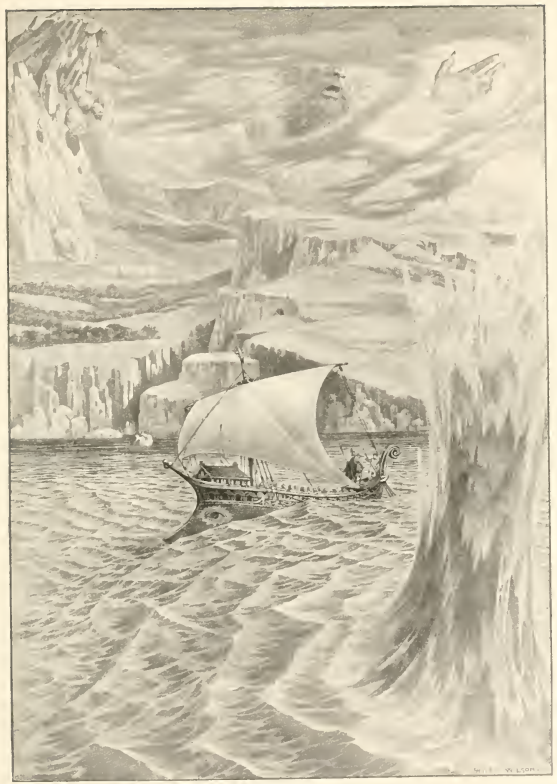
ODYSSEUS AND THE CYCLOPS