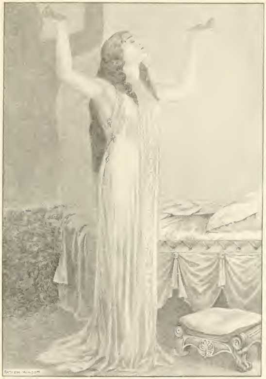
THE PRAYER OF PENELOPEIA