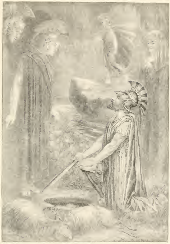
IN THE WORLD OF THE DEAD