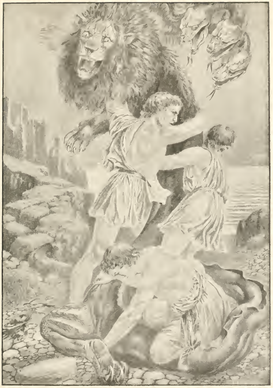
THE STRUGGLE WITH PROTEUS