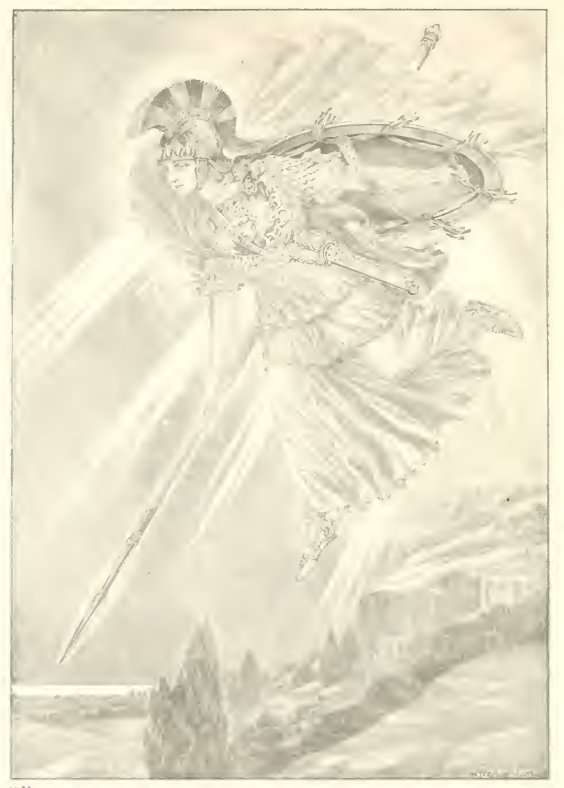
"Flashing she fell to the fart'i from the glittering heights of Olympus"