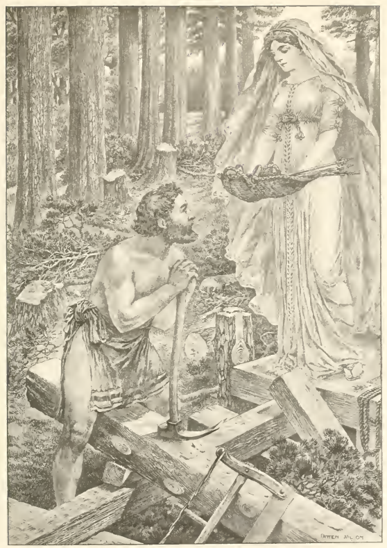
THE BUILDING OF THE RAFT