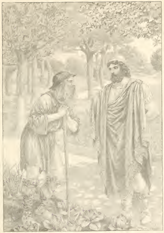
ODYSSEUS AND LAERTES