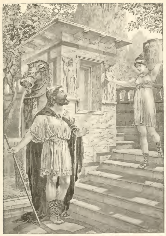
"NIGH TO THE GATE THERE MET HIM THE GREY-EYED GODDESS ATHENE"